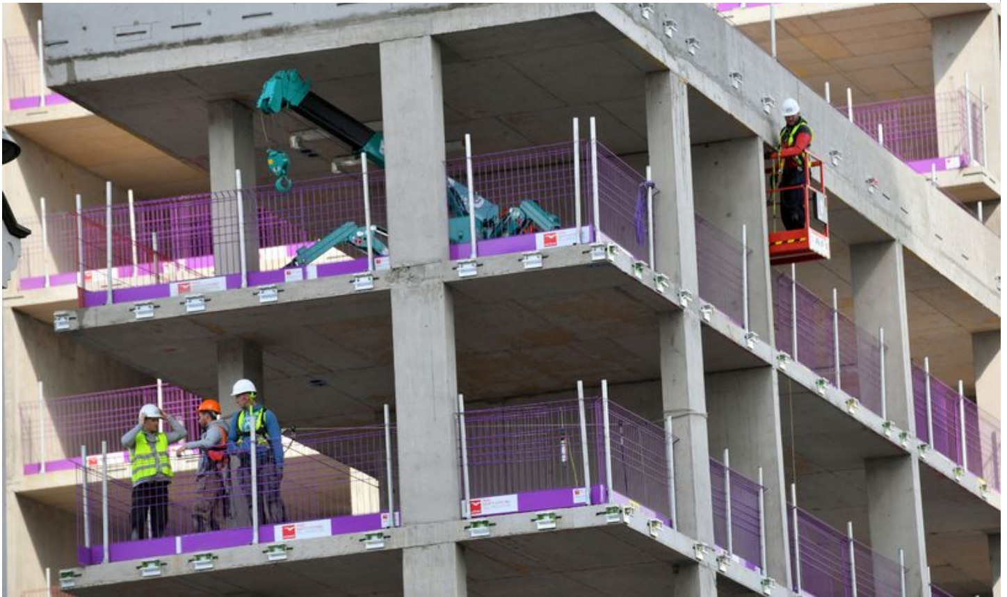
Student accommodation under construction in Cardiff

Get Business updates directly to your inbox